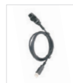
Programming Cable (USB Port)