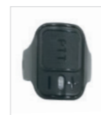
Wireless Finger PTT