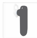
BT Wireless earpiece