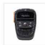
BT Wireless remote speaker microphone