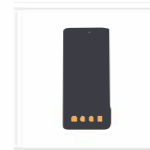
2000mAh Li-polymer Battery