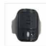
BT wireless ring PTT