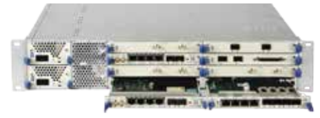
AGS20L 2RU - 8 modular slots

AGS20L aggregates traffic incoming from multiple IF based ODU and Ethernet based full outdoors, all feeding into a single node. Its modular design offers full redundancy (no Single Point of Failure) regardless of the radio configuration, improving resiliency of aggregation and backbone sites.